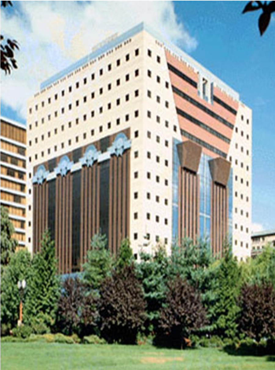
Portland Public Services Building, 1982. Michael Graves.