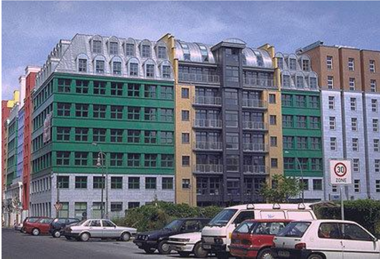
Newspaper Area Complex, Aldo Rossi, 1996