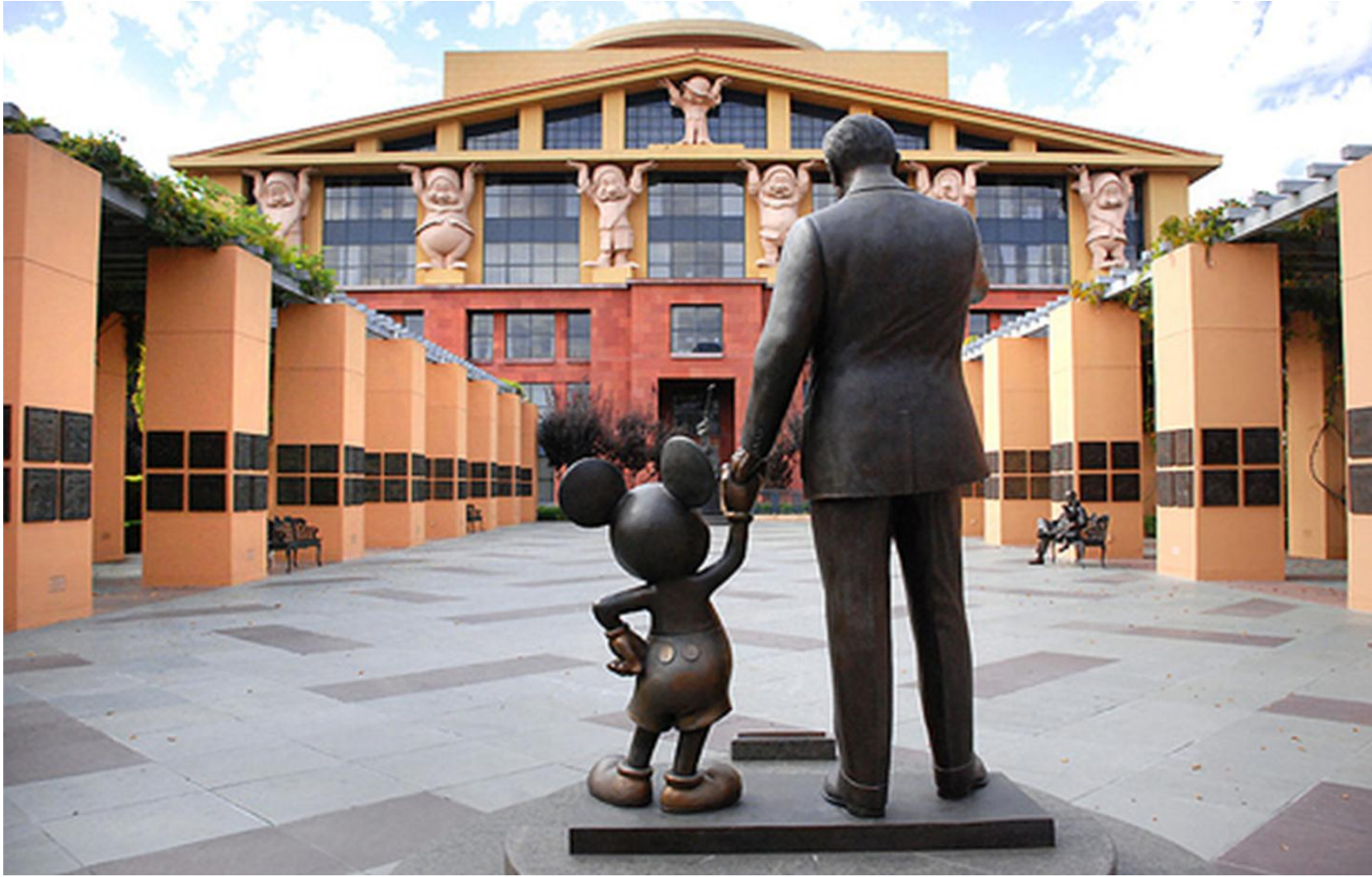
Michael Graves, Team Disney - The Eisner Building, 1991. POSTMODERN