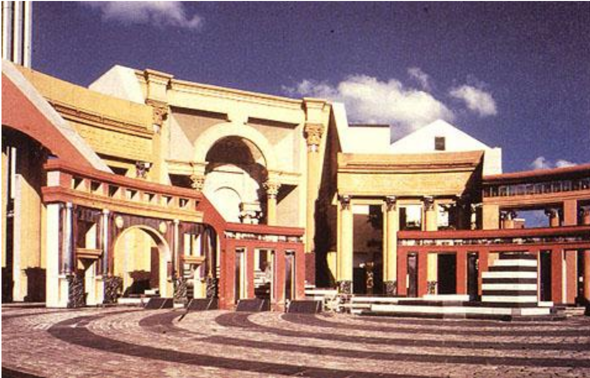
the Piazza d'Italia in New Orleans, Charles Moore, 1976-79

Built in the late Seventies, it is a fake Roman ruin. The neighborhood has a historical connection with the Italian community.