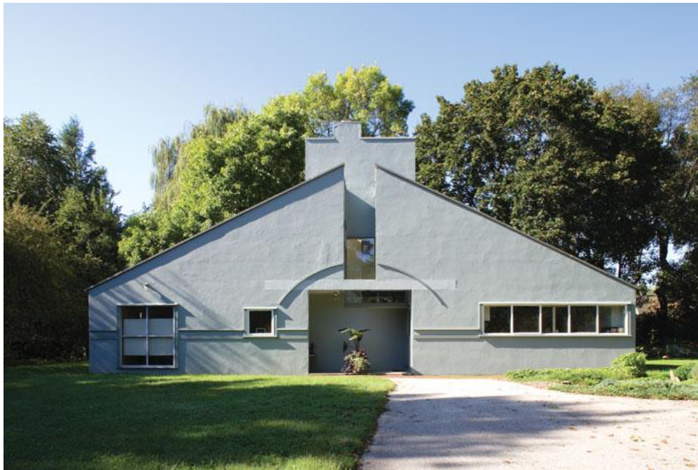
Venture Vanna House