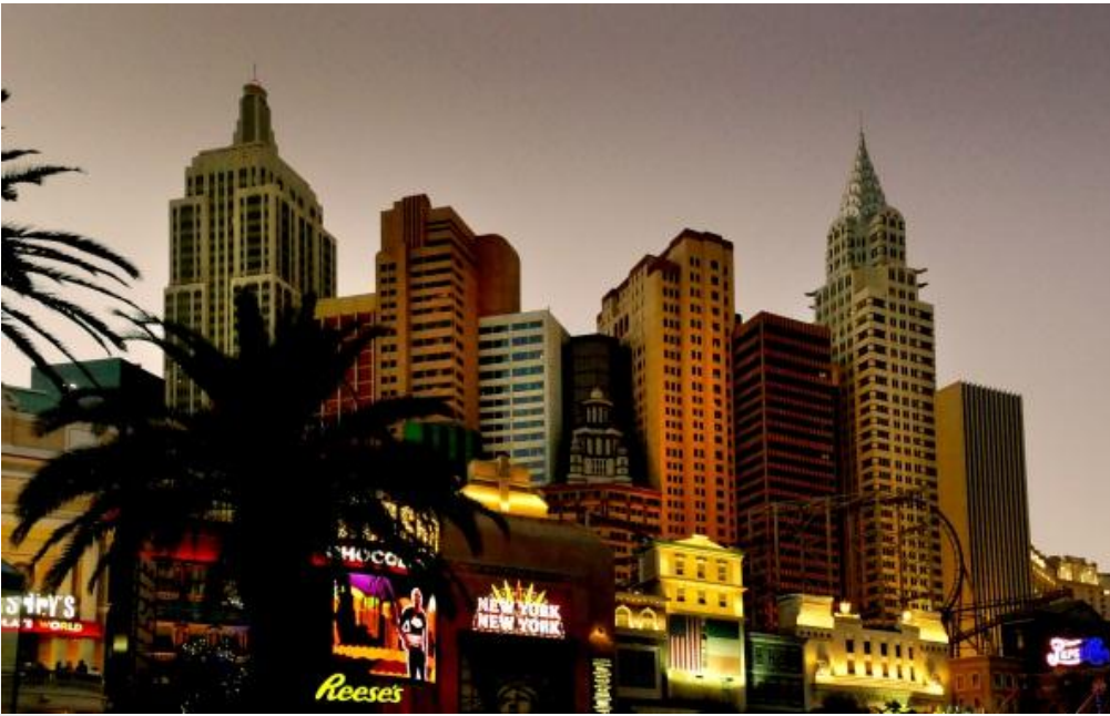
New York-New York Hotel and Casino