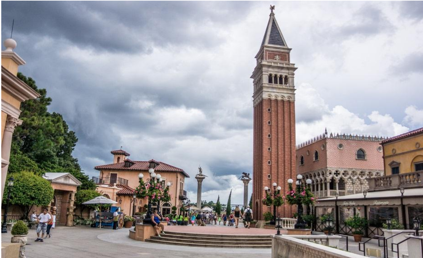
Disney Epcot Center