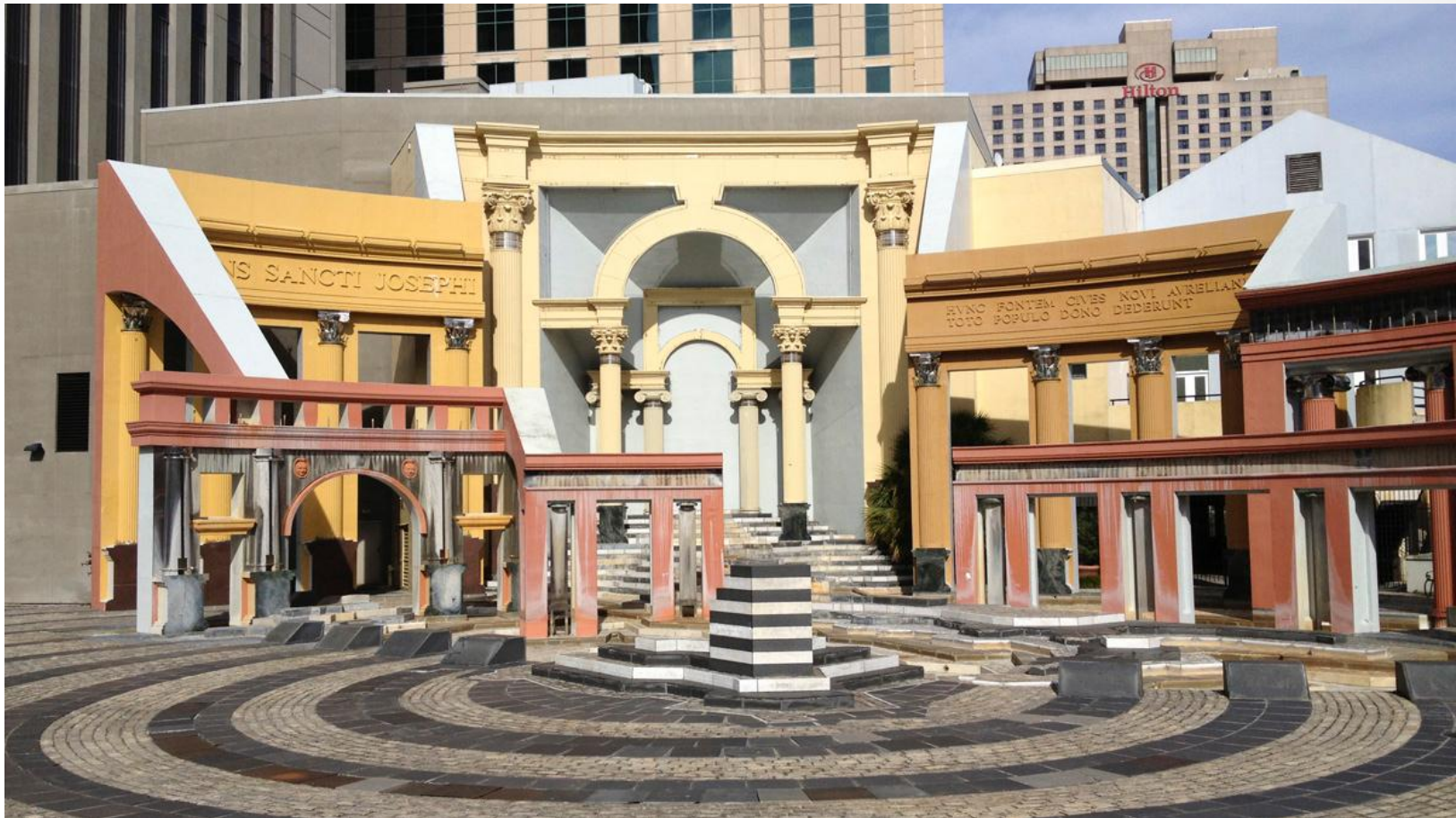
An example of historical eclecticism: Piazza D'Italia by Charles Moore