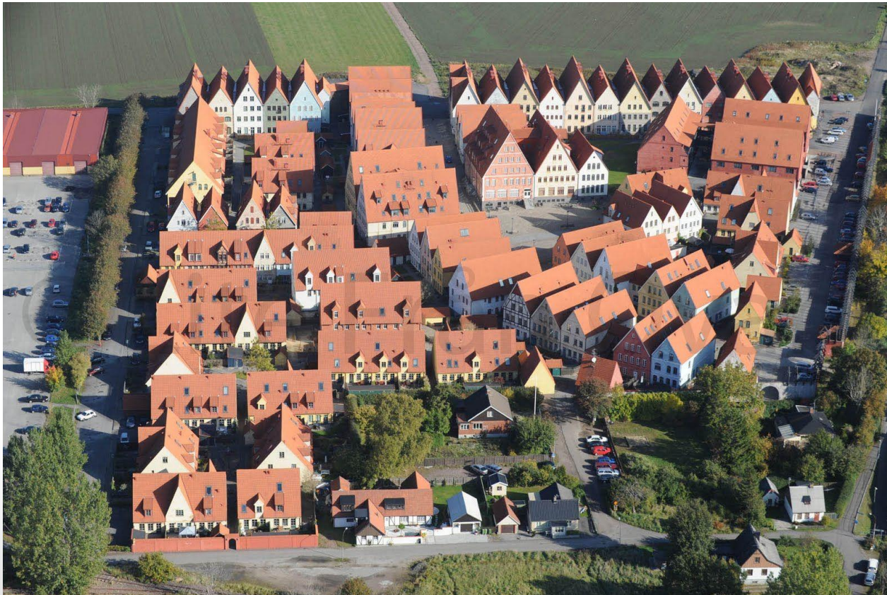
Jakriborg post urban